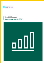
Top 100 Funded UK Companies in 2017