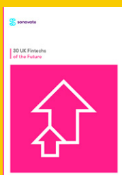
30 UK Fintechs of the Future

Sonovate is the UK's leading provider of finance, technology and support to contract recruitment businesses. Sonovate enables companies to unlock cashflow, run more contractors and grow their business.